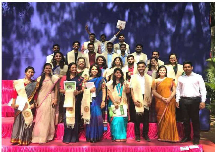
MA/MSc Students: 2015-17