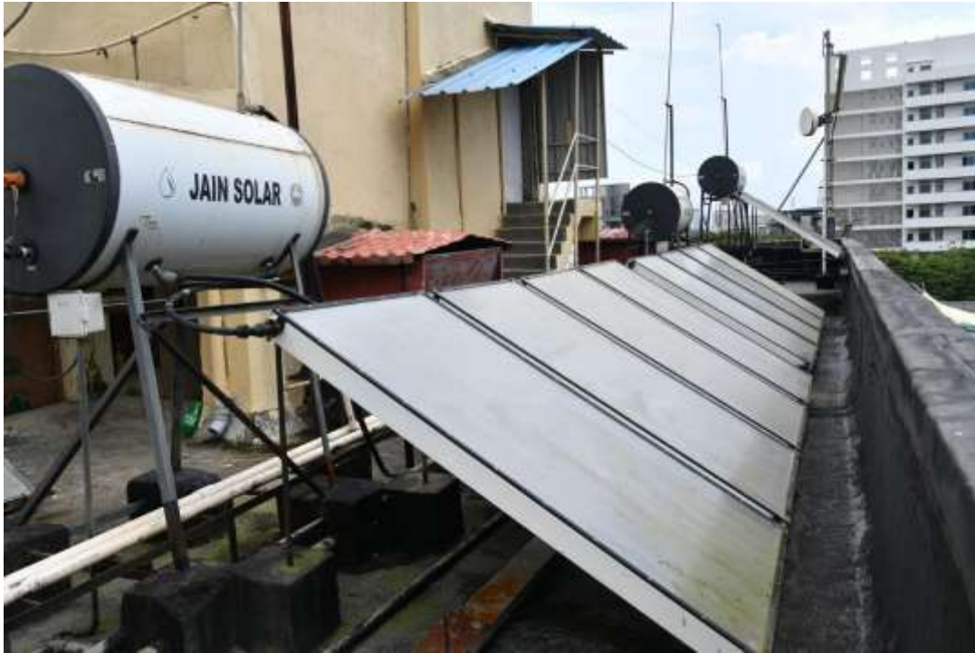
Solar energy water heater panels (Hostel-1)