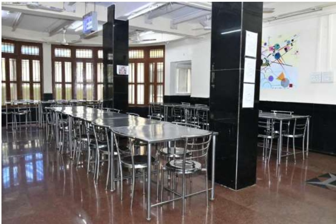
LED tube lights (Hostel Mess)