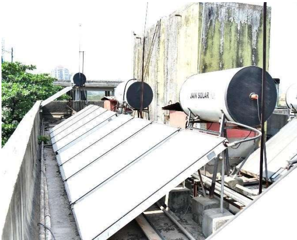
Solar energy water heater panels (Hostel-2)