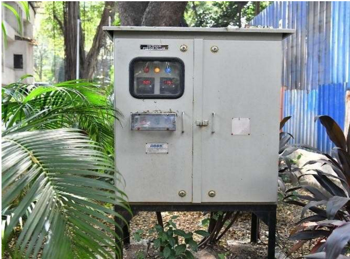
Sensor based energy conservation