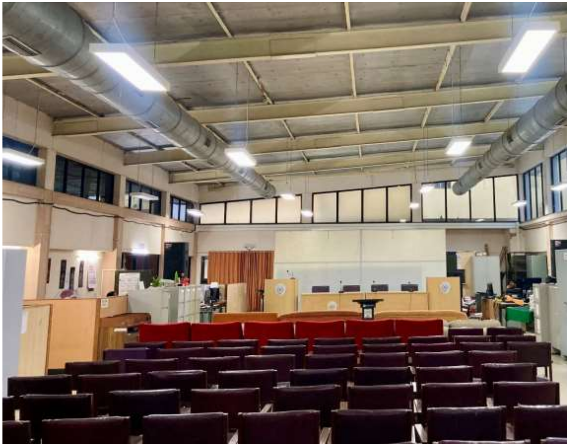
Led Lights (3 rd floor Library Building)