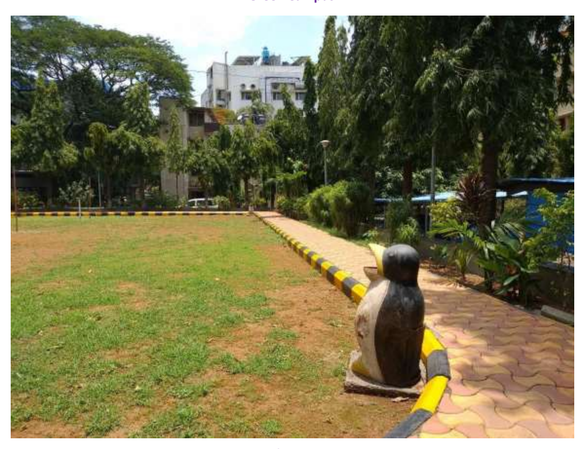
Pedestriean friendly pathways