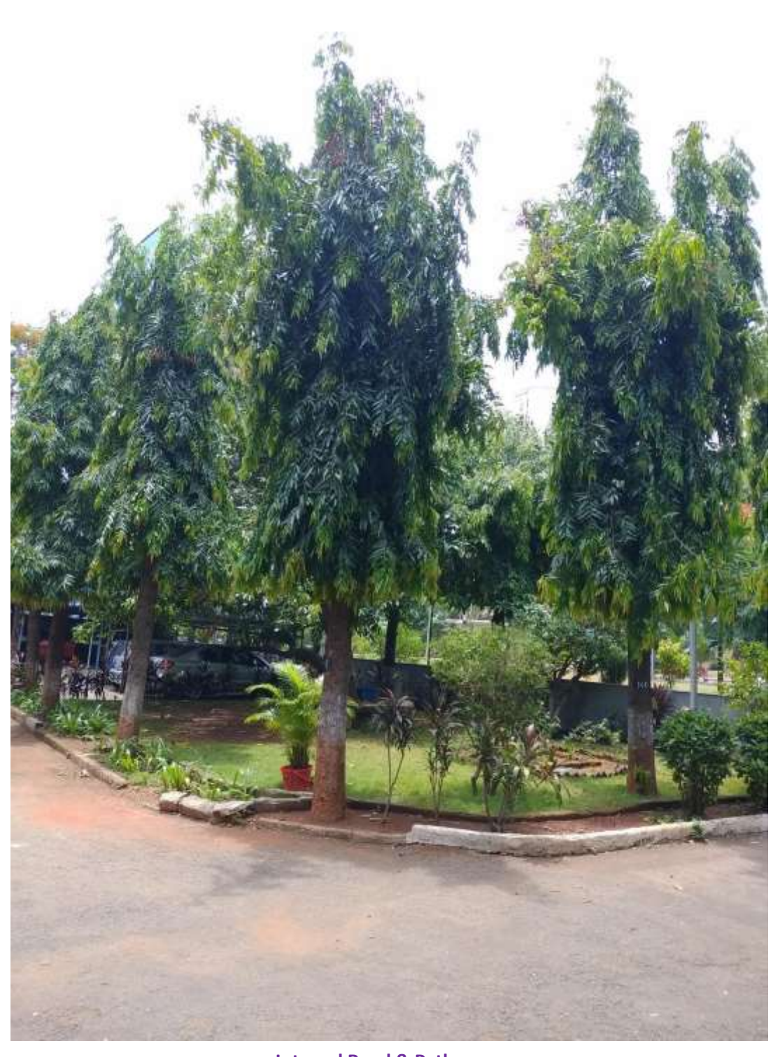
Internal Road & Pathways