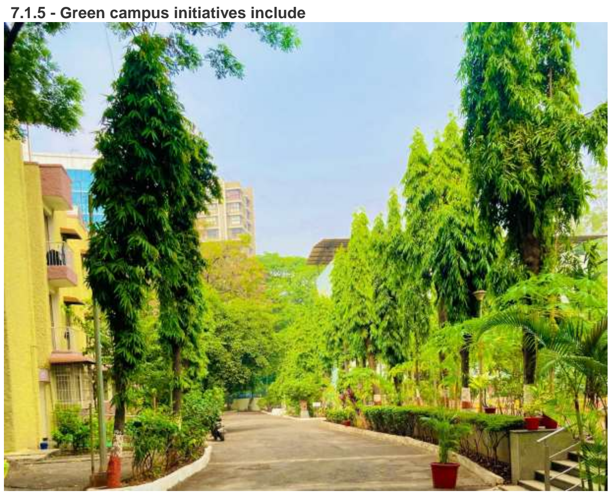
Internal Road with Trees