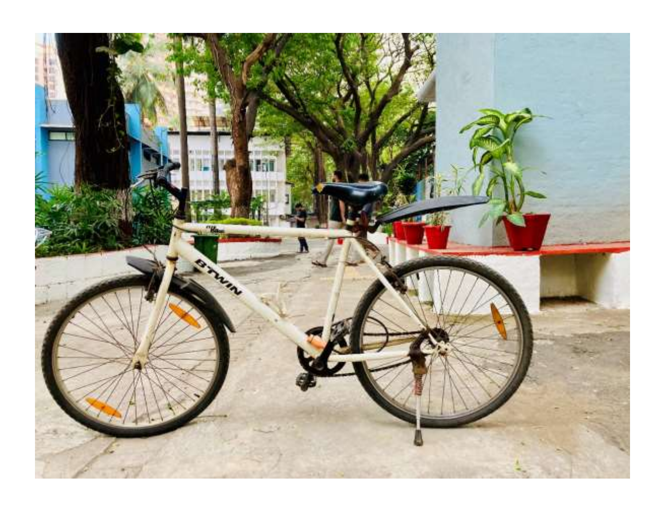
Use of bicycles