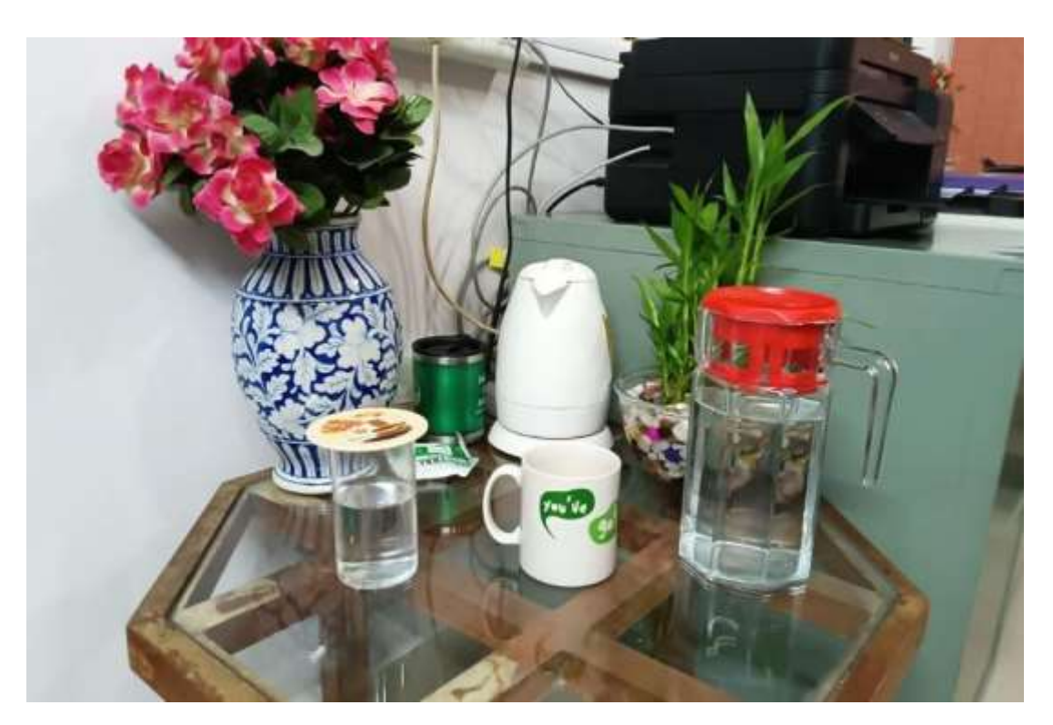
Plastic free office room