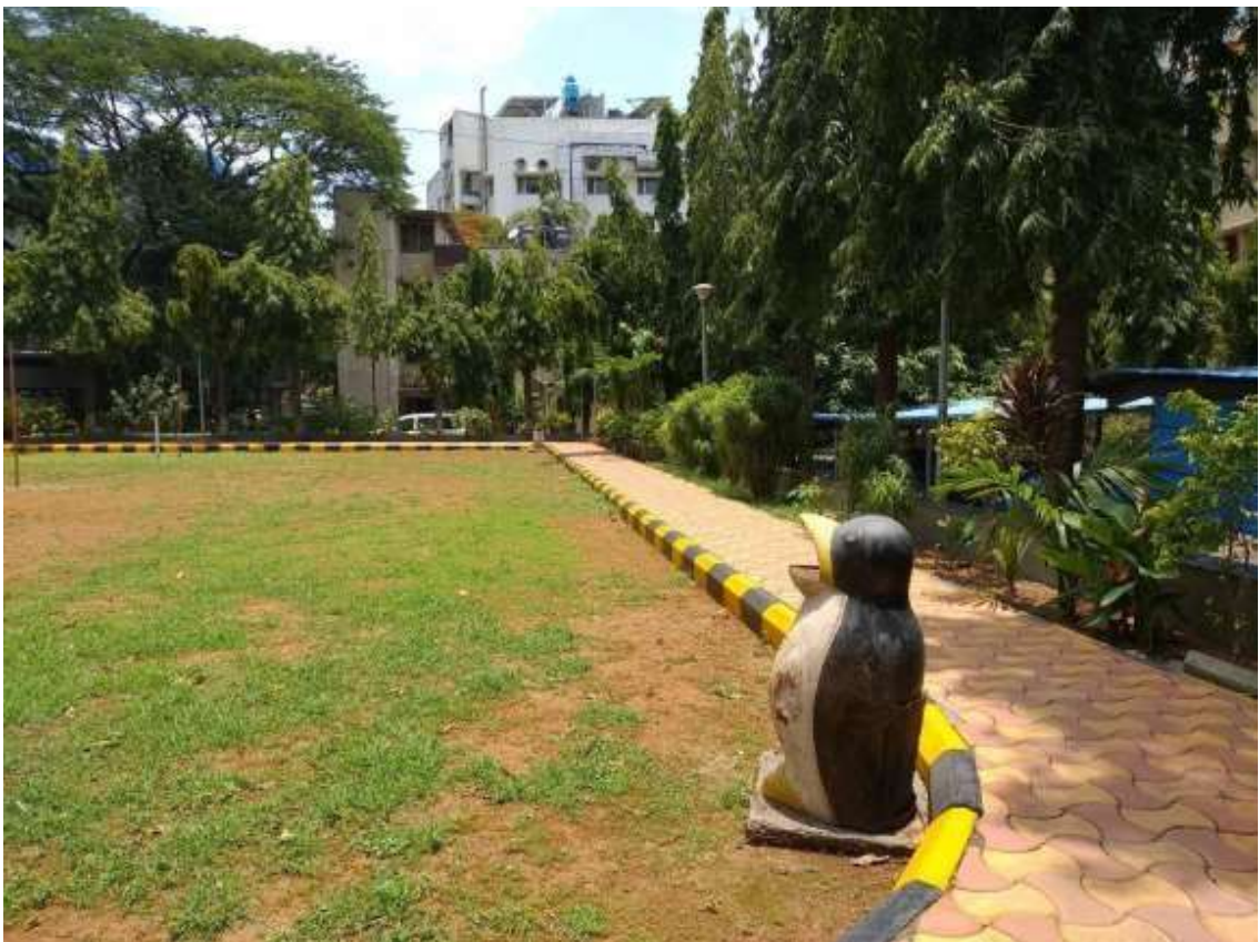
Pedestrian friendly pathways