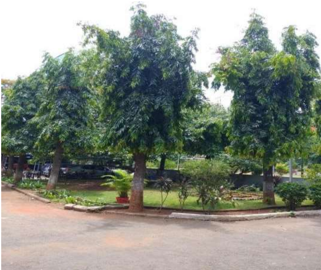
Internal Road & Pathways