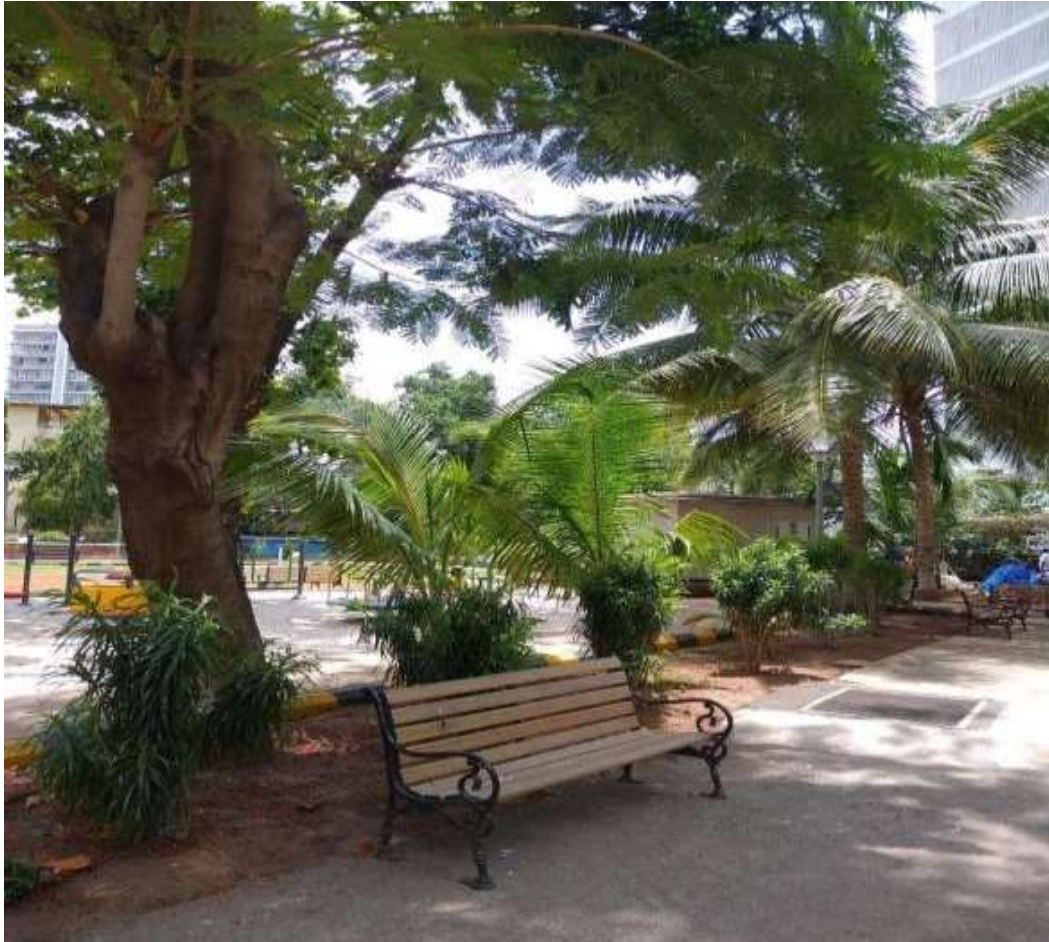
Pedstrian Pathway 2