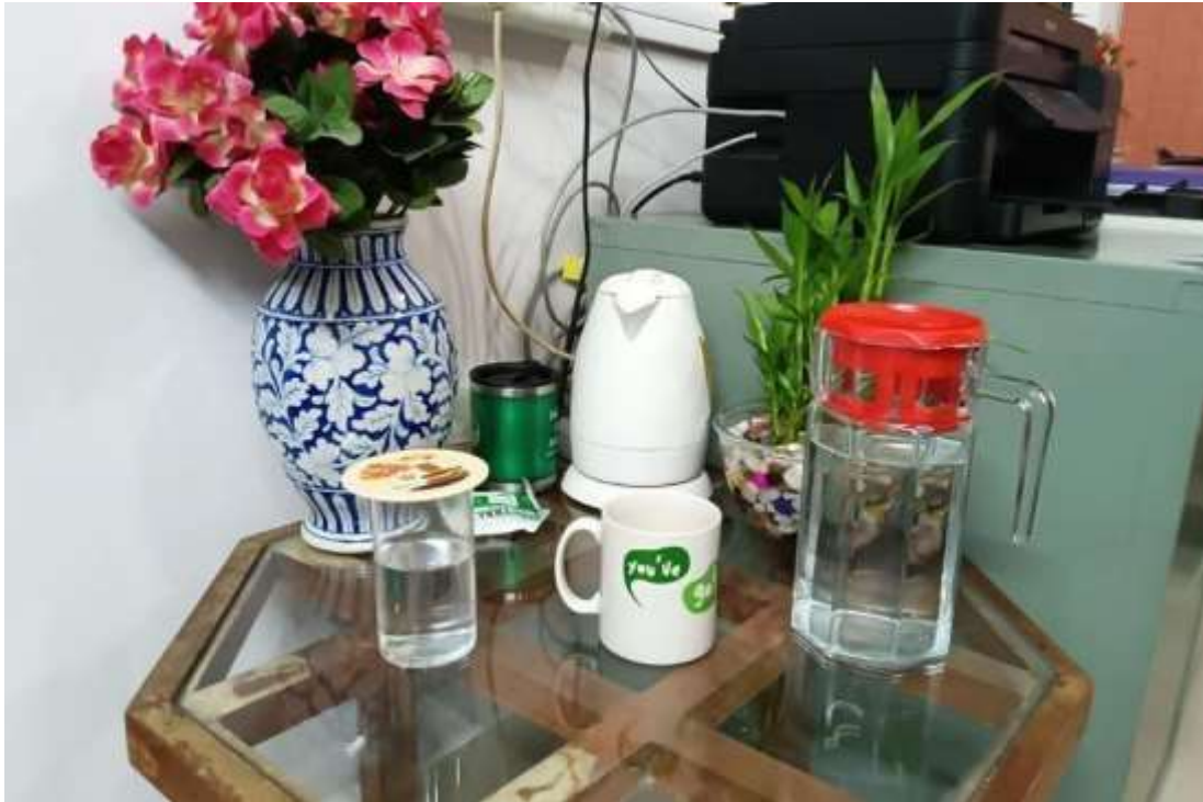
Plastic free office room