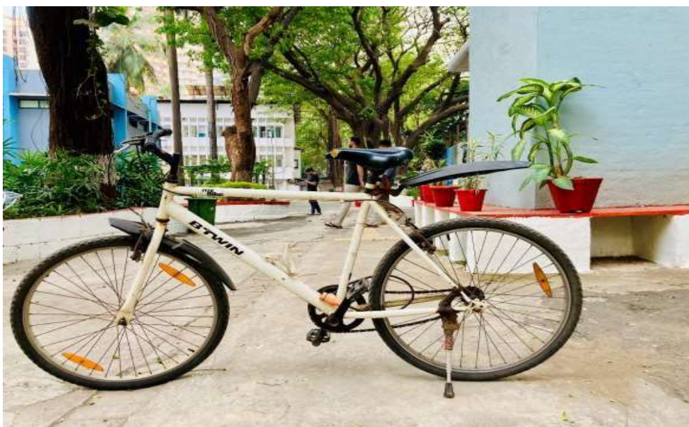
Use of bicycles