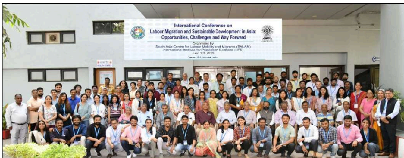
IAS, Former Chief Secretary, Govt. of the release of the book 'Researching Internal

With a total of 200 in-person and 40 virtual participants from diverse regions, including Pakistan, Nepal, Bangladesh, Germany, Kenya, Sri Lanka, Sweden, India, and the USA, the conference provided a global perspective. Over 100 presentations covered a broad spectrum of labor migration topics, encompassing policy frameworks, economic impacts, social aspects, and the well-being of migrant workers, showcasing the diversity of research in the field. Despite challenges, the conference was successfully organized by a dedicated team, including IIPS faculties, staff, and students. The Valedictory Session was chaired by, Prof. Bino Paul, Deputy Director and Pro-Vice Chancellor of TISS, Mumbai, along with Prof. K S James and Prof. S. Irudayarajan. The session also witnessed