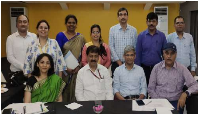
meeting for the National Family Health Survey-6

The Fourth Technical Advisory Committee (TAC)