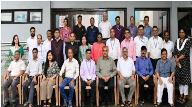
Programme Cell at the International Institute for

A "Two-Week Demographic Training for Nepal Census Officials" was held between September 11 and September 21, 2023. This training initiative was organized jointly by the Short-Term Training