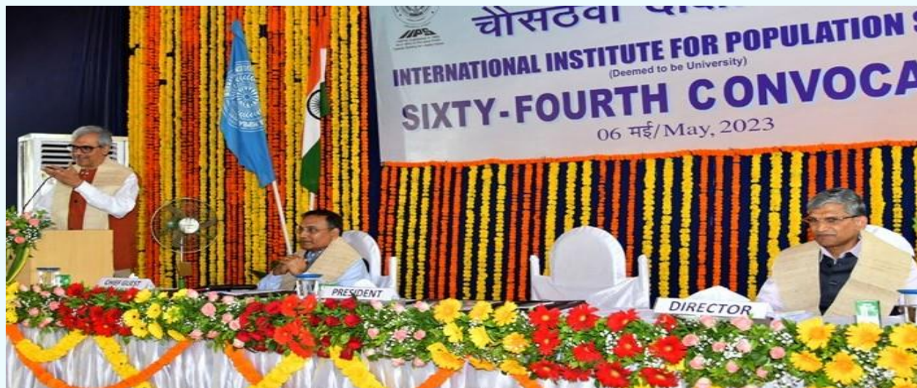
64 th Convocation of IIPS