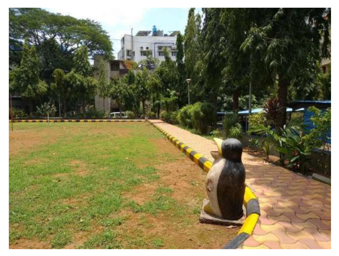
Pedestrian friendly pathways