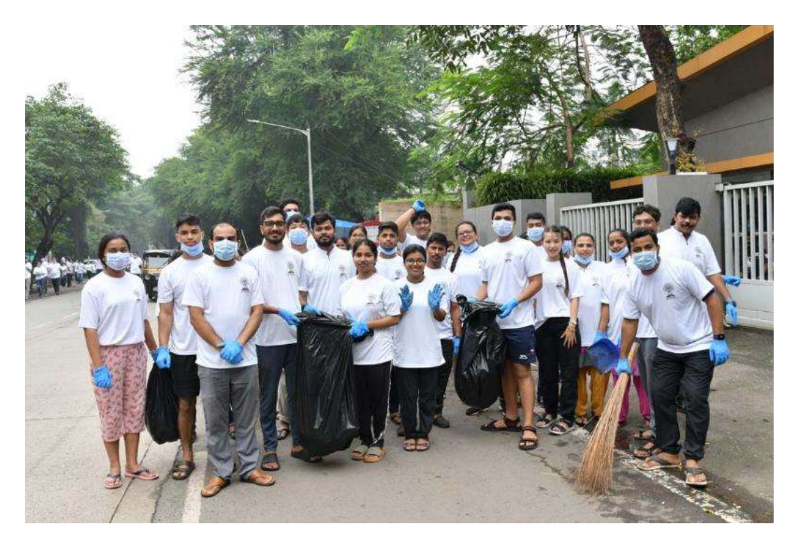
Beyond the campus environmental promotional activities

7.1.6 - Quality audits on environment and energy are regularly undertaken by the institution