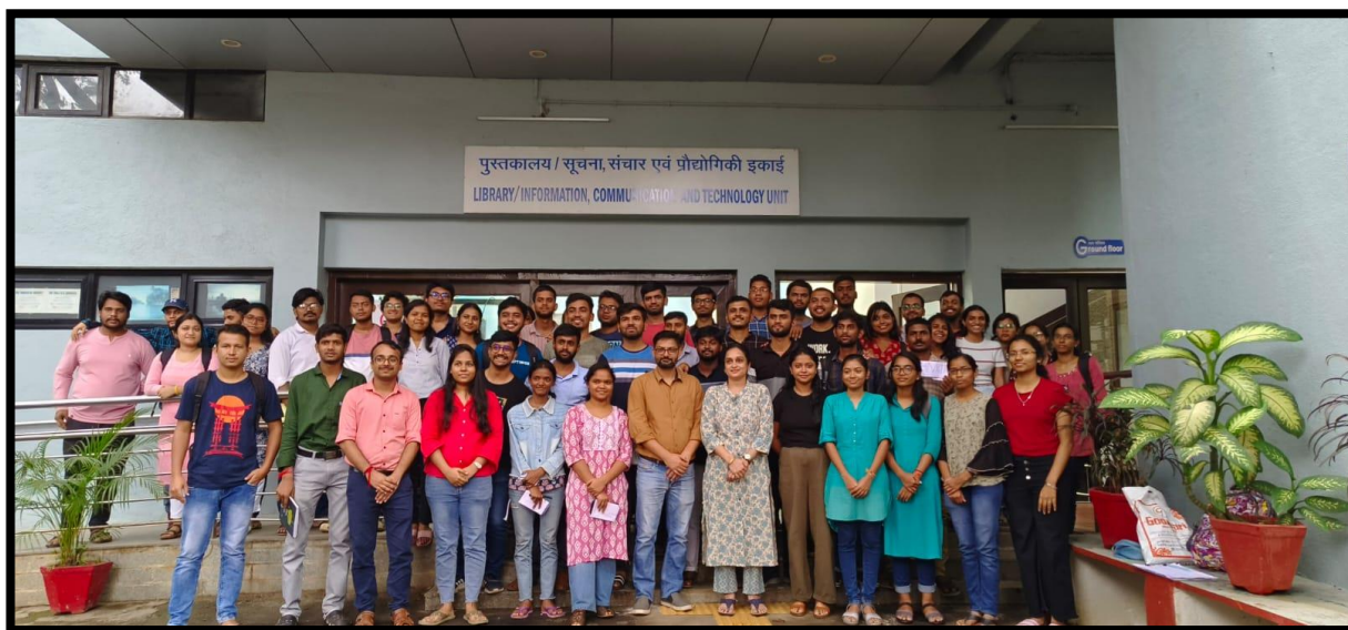
Group picture of the participants of the workshop, Day 1