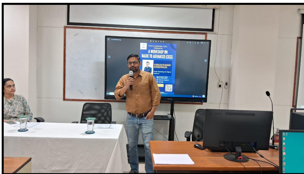
The successful ongoing of the workshop

The two-day workshop entailed the understanding of excel from a beginner's perspective. The instructor began by giving a brief introduction to the sequence of the workshop. He stated the main aim of the workshop, which was to provide the participants with exposure to techniques of Data Analysis through Excel. He then started with basic functioning of the excel.