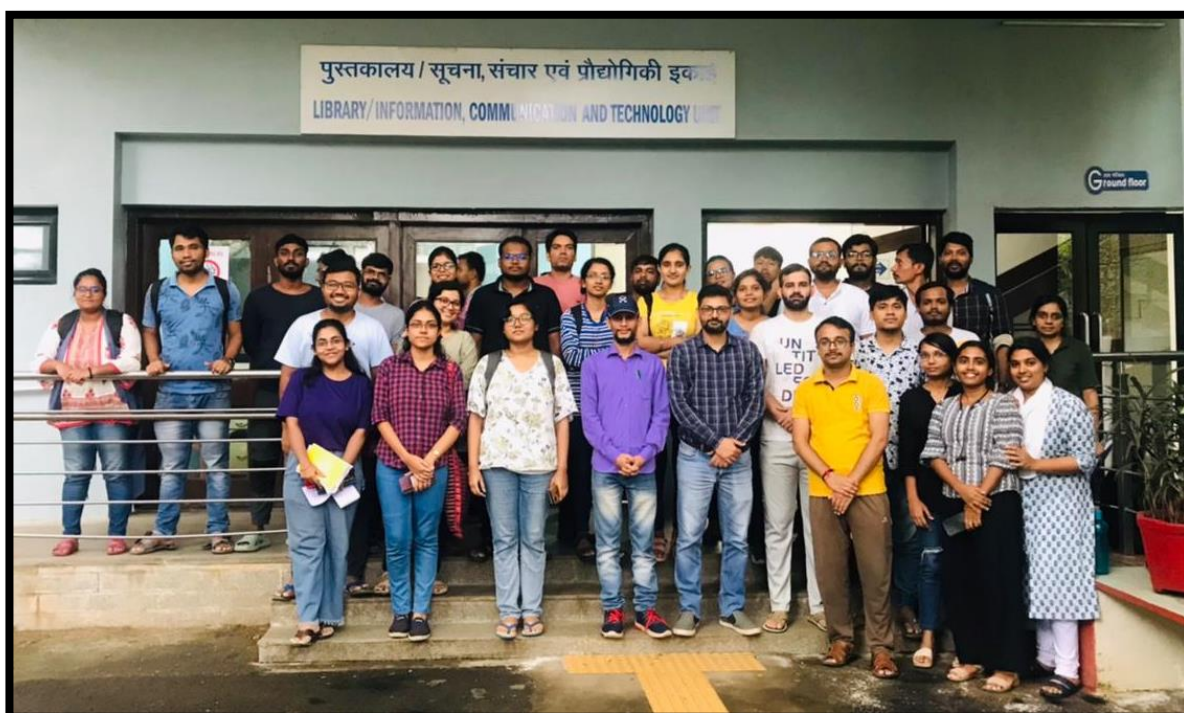
Group picture of the participants of the workshop, Day 2