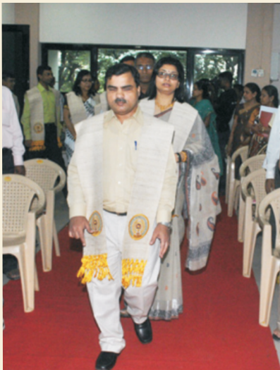
(Above) Academic procession entering the hall